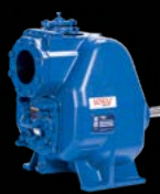
Ultra V Series® Self-Priming