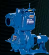
10 Series® Self-Priming