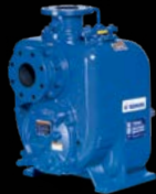
Super U Series® Self-Priming