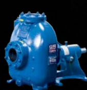
80 Series® Self-Priming