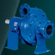
6500 Series® Standard Horizontal End Suction