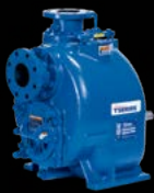
Super T Series® Self-Priming